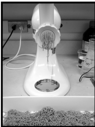
Extrusion of dough through meat grinder

May add: Spirulina (0.5-1.0% of diet); or Astaxanthin (10-40 mg/100g of diet).